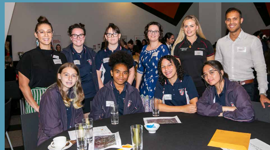
Image: Monadelphous representatives with high school students at the 2019 Inspiring Girls Career Forum hosted by the Chamber of Minerals and Energy, Western Australia.